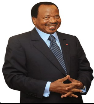
S.E.M Paul BIYA President of the Republic, Chief of the Armed Forces .